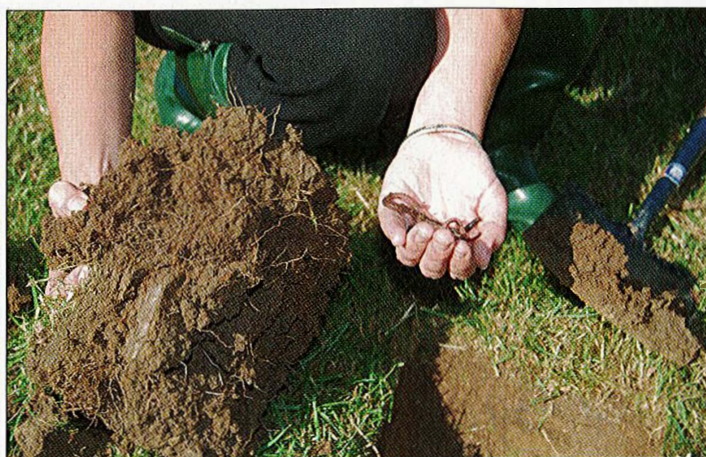
Well-fed worms will be a deep red/brown colour and very active

2. Soil physics (soil structure): One of the most useful tools is the Visual Evaluation of Soil Structure (VESS) to assess your soil's physical condition. This provides a soil quality